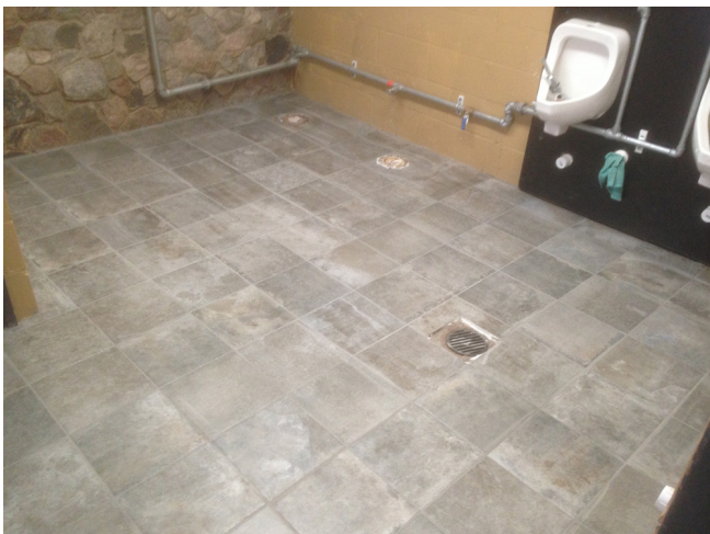
New tile progress in bathrooms. Note all new plumbing and lowering of fixtures.