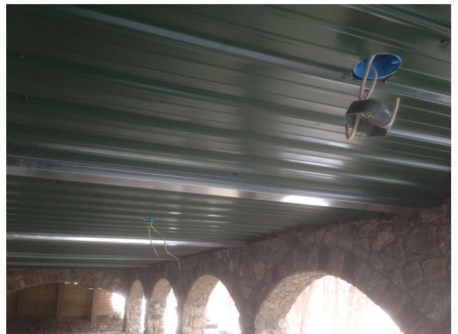
New metal roof installed on the "alcove" ceiling outside the bathrooms. Includes a new door too.