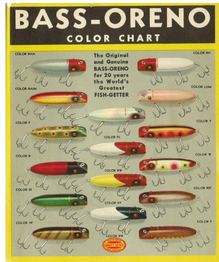
Page from 1939 South Bend Bait Catalog