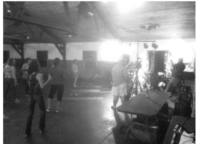
The Whistle Pigs serve up their regular fare of great dancing music!