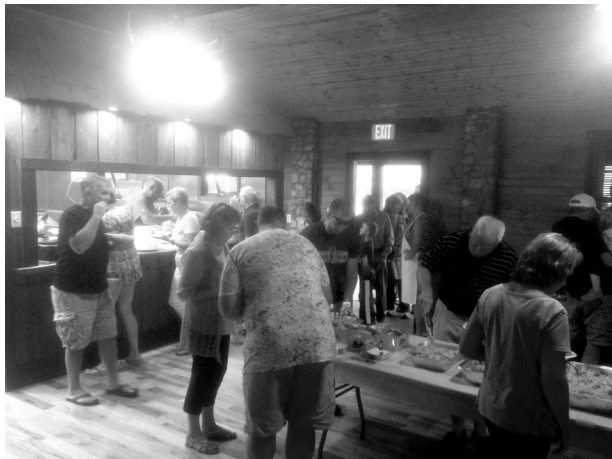
Guests stream into the kitchen for their annual serving of hog, corn and all the trimmings.